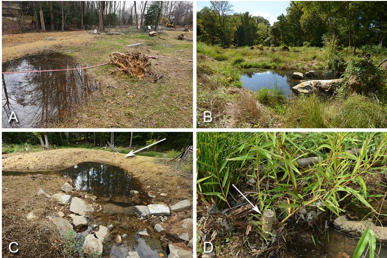
Figure 5. The planners dubbed the project's largest, multi-pooled artificial wetland, "Frog Disneyland" (A, during construction, and B, after). It is 900 feet east of Roberts Road. Instead of being fed by the creek's floods, Frog Disneyland's water comes from a large storm drain outfall—one that was a major source of pollutants entering Shanes Creek and the reason for so much work at this location. After exiting the outfall, water collects in front of a berm (C, arrow) that separates the pool from Shanes Creek before making a 90° turn into the wetland. The plant roots here, including this black willow ( Salix nigra ) sprouting from a livestake in the ground (D), filter pollutants and clean the effluent before it enters the creek. Reducing usage of pesticides and other chemicals that contaminate runoff will improve the environment even more! Frogs are breeding in these artificial depressions as they do in vernal pools . Amphibian populations help gauge a habitat's health because they are sensitive to environmental changes .

Part 1 of this series examined some of the main features found in the newly restored sections of Shanes Creek. Let's start this installment with a look at the biggest artificial wetland in the project. The figure numbers resume where they last left off.